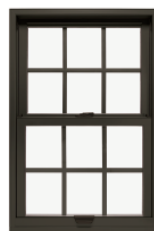
Interior All Ultrex Double Hung Window in Bronze with Oil Rubbed Bronze hardware