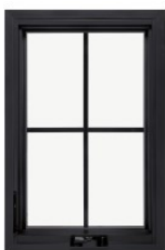
Interior All Ultrex Double Hung Window in Ebony with Matte Black hardware